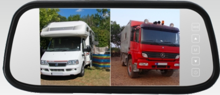
7 INCH SPLIT MIRROR MONITOR (KV-4136S)