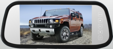
7 INCH REPLACEMENT MIRROR MONITOR (KV-4136)

Please read this manual carefully before operating monitor, and retain for future reference.